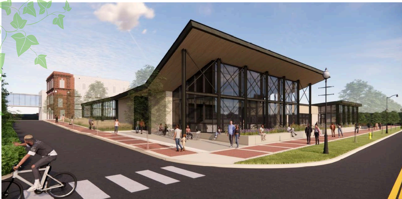
Urban Farm Center rendering by Demonica Kemper Architects.