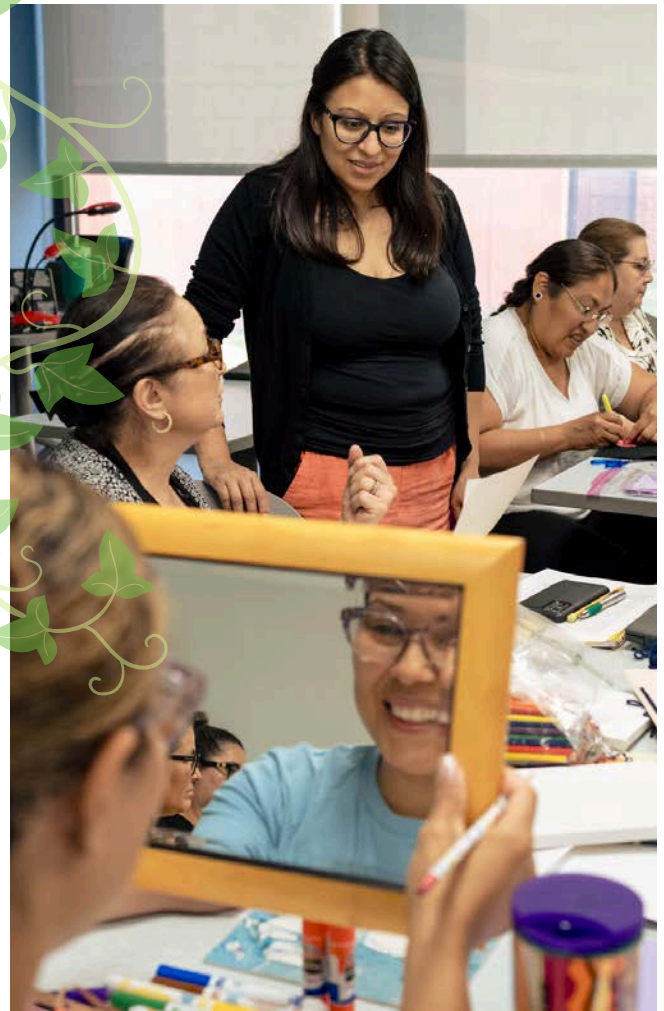
Early childhood education course onsite at the CLC Grayslake Campus, 2024.

As the program continues to thrive, it stands as a testament to the power of education to cultivate resilience, nurture opportunity and plant the seeds for a thriving community for years to come. --